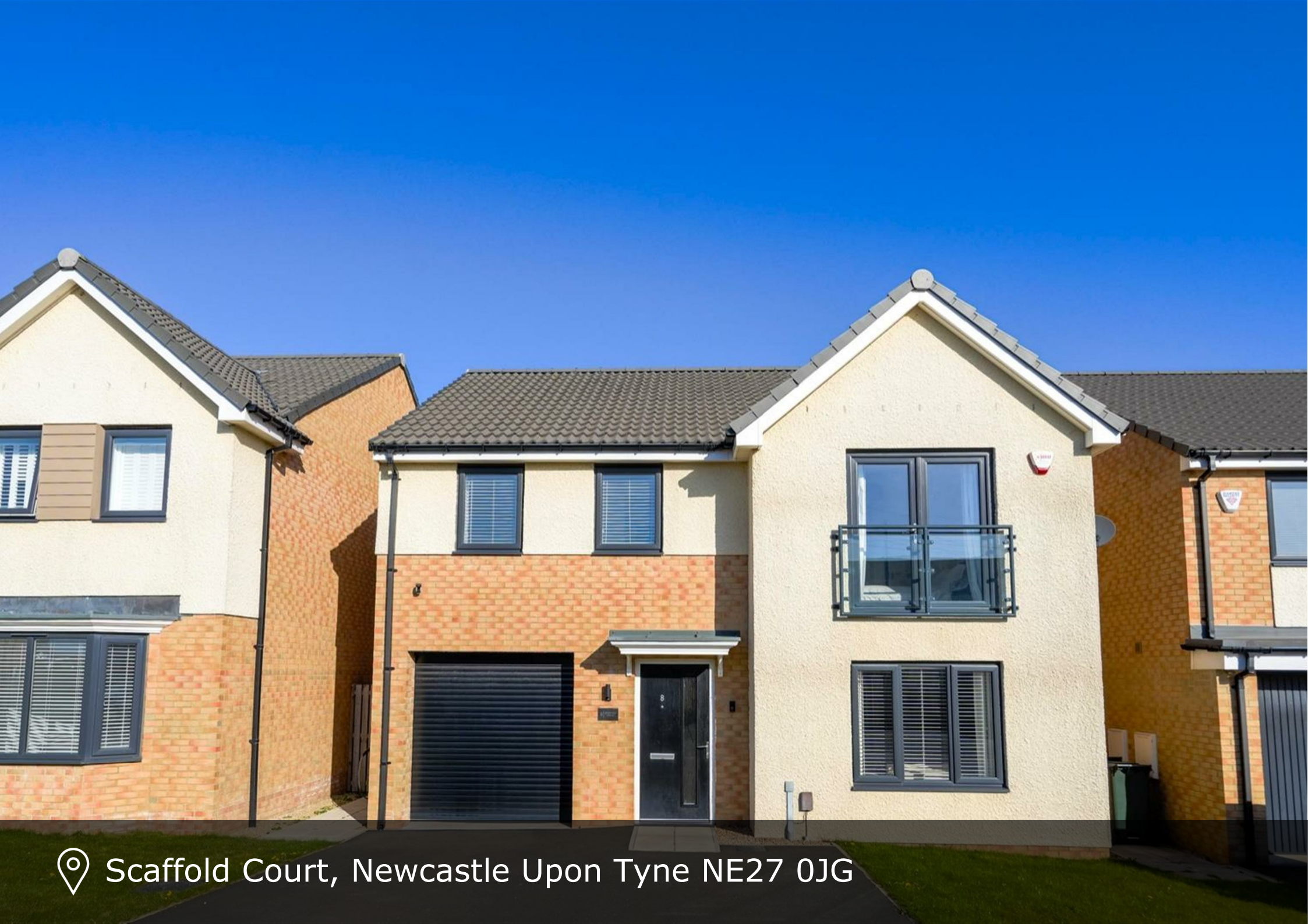
📍 Scaffold Court, Newcastle Upon Tyne NE27 0JG